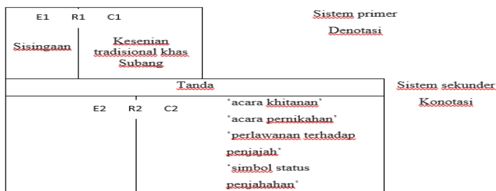
Figure 3 Analysis of Denotation and Connotation

The development in the [C] aspect of the result is that a sign has more than one [C] for the same [E]. In Lion [E] whose meaning [C] in the primary system is 'short for sisingaan, the brand of traditional art of Subang Regency. In the next process, the primary meaning [C] developed into 'circumcisions', 'weddings', 'resistance to invaders', or 'symbol of occupation status'. The development of the meaning [C] by Barthes is called connotation. At the connotation stage, there is a development of eating in sisingaan terms, this is also in accordance with the explanation from Mr. Dase. That Sisingaan is no longer as popular entertainment, but as a commercial performing art.