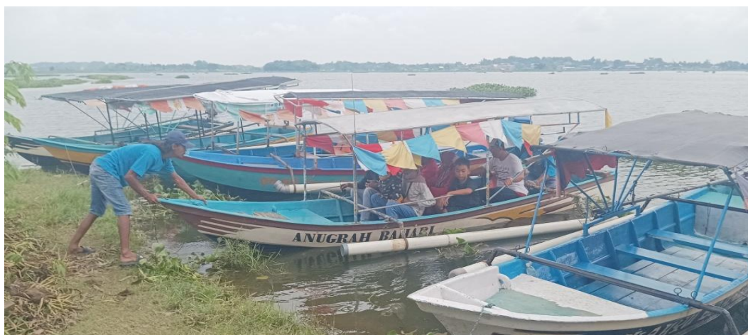
Figure 5. Visitors Riding the Mini Boat

The use of life jackets is essential for all passengers as wearing a life jacket while on a boat is a mandatory rule enforced by all boat operators. This will reduce the risk of drowning or serious accidents in the event of an incident on the water. Buoys also facilitate rescue efforts by the SAR team or relevant officers in an emergency (Figure 6). In addition, the use of life jackets gives passengers a sense of security and comfort, allowing them to enjoy the ride more calmly and worry-free. By conducting counseling and training on the importance of water safety for visitors. This includes how to properly wear a life vest and emergency measures in the event of an accident and visitors will be better prepared to deal with unexpected situations on the water. This education and training not only equips them with essential knowledge, but also raises awareness of personal safety. Thus, safety on the water can be assured and the tourist experience will be more enjoyable and worry-free. In addition, through this education, tour operators can create a safer environment and demonstrate their commitment to visitor welfare. The knowledge gained from this education can also be applied in daily life, making visitors more vigilant and responsible when around water.