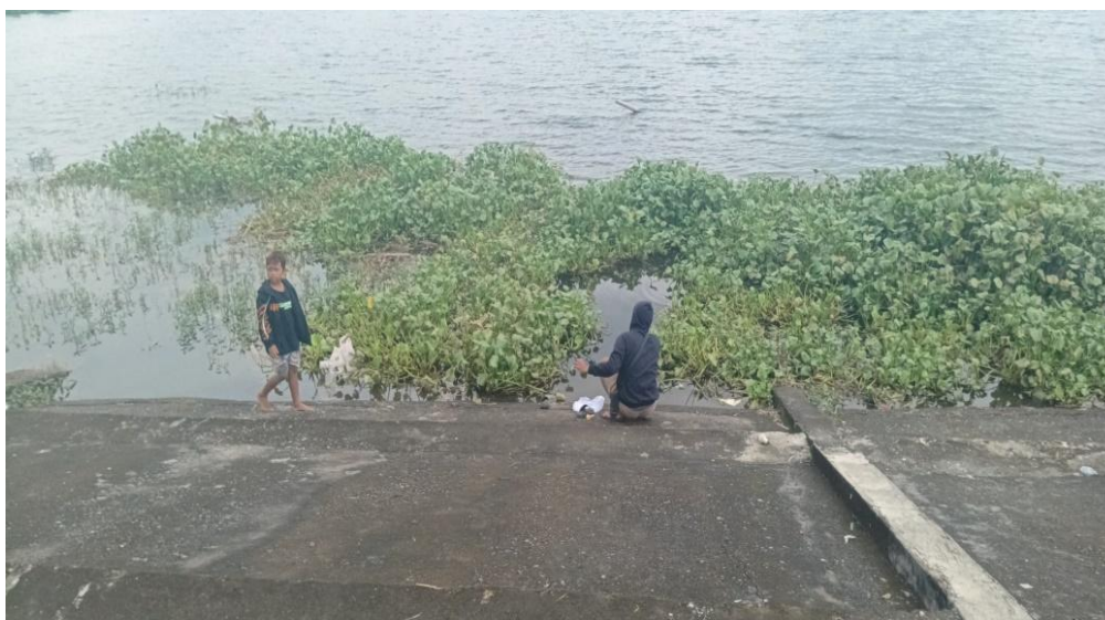
Figure 3. Visitors Engaging in Fishing Activities

Fishing is one of the main activities at Cengklik Reservoir. Visitors can enjoy fishing comfortably at various points around the reservoir. Fish that are often found in this reservoir include tilapia, catfish and gabus. With a calm environment and clear water, Cengklik Reservoir offers a pleasant fishing experience for beginners to experienced anglers. In addition, the reservoir's fishing spots provide enough space for visitors to enjoy their time without having to jostle for space. The regulations applied regarding fishing methods and the type of equipment used also help to preserve the fish population in this reservoir, so that the hobby of fishing can continue to be enjoyed in the long run. Fishing at Cengklik Reservoir not only provides entertainment but also an opportunity to relax and enjoy nature. Many visitors come to spend time with family or friends, enjoying the peaceful and fresh atmosphere around the reservoir (Figure 3). With various supporting facilities available, the fishing experience at Cengklik Reservoir is one of the main attractions for nature lovers and outdoor activities.