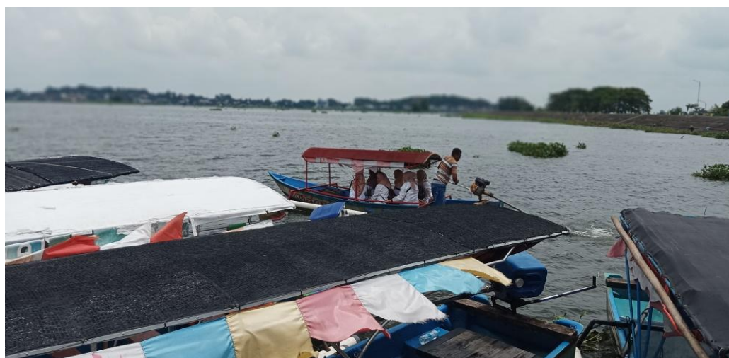
Figure 6. Visitors Riding Mini Boats Without Using Buoys

The use of life jackets is essential for all passengers as wearing a life jacket while on a boat is a mandatory rule enforced by all boat operators. This will reduce the risk of drowning or serious accidents in the event of an incident on the water. Buoys also facilitate rescue efforts by the SAR team or relevant officers in an emergency (Figure 6). In addition, the use of life jackets gives passengers a sense of security and comfort, allowing them to enjoy the ride more calmly and worry-free. By conducting counseling and training on the importance of water safety for visitors. This includes how to properly wear a life vest and emergency measures in the event of an accident and visitors will be better prepared to deal with unexpected situations on the water. This education and training not only equips them with essential knowledge, but also raises awareness of personal safety. Thus, safety on the water can be assured and the tourist experience will be more enjoyable and worry-free. In addition, through this education, tour operators can create a safer environment and demonstrate their commitment to visitor welfare. The knowledge gained from this education can also be applied in daily life, making visitors more vigilant and responsible when around water.