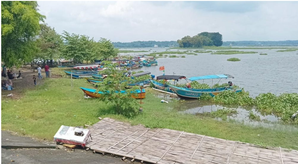
Figure 4. Boat Tour Activities

In addition, the experience of traveling around the reservoir by boat provides a different perspective that enriches the visit. Travelers can feel the tranquility of the water, listen to the sounds of nature, and even interact with local animals that may be spotted around the reservoir. The boat trip is also the perfect moment to capture memories with family or friends, set against a backdrop of stunning natural scenery (Figure 4). With all its uniqueness and beauty, boat tours at Cengklik Reservoir offer visitors the opportunity to explore and enjoy the wonders of nature from a different perspective, creating an unforgettable experience that will always be remembered.