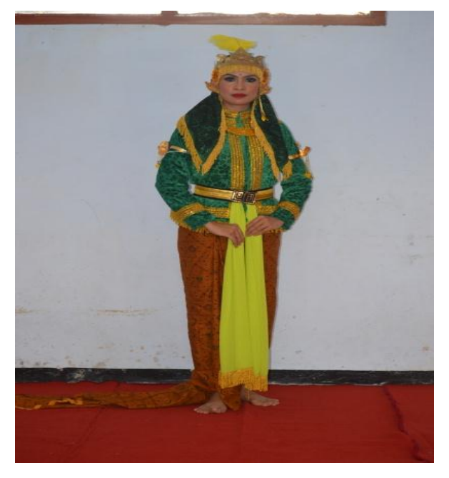
Figure 3 Front look of Bedhaya Sri Nawa Kumala outfit and makeup of the dancer (Wahyu, 2017)

effect when it is wagged. The color green was selected by Guruh Sukarno Putra because it is the favorite color of the Queen of the Southern Sea. The costume was designed by Guruh Sukarno Putra as shown in figure 3.