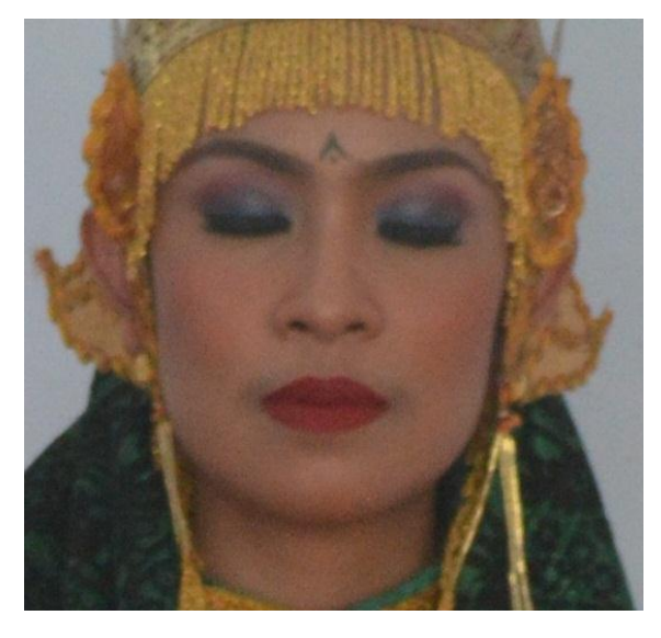
Figure 2 Makeup of Bedhaya Sri Nawa Kumala dancers (Wahyu, 2017)

Outfit and makeup are crucial elements in a show to strengthen the atmosphere and bring up the characters in Bedhaya Sri Nawa Kumala dance. The nine dancers wear the same outfit and makeup as shown in figure 2. For makeup, the dancers use blue, black, and red eye shadow , and white colored highlight . Their eyebrows are dark brown, orange blush on for cheek, and bright red lipstick. The makeup is not too flashy to show the dancers' natural beauty because the show is performed during the day. The color selection was on the deal of the dancers.