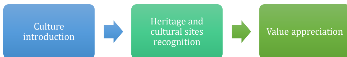
Figure 1. Stages of French Culture Introduction Approach

The authors developed an analysis divided into seven discussion results from the observations, literacy studies, and interviews with informants. The seven discussions explain the tourism product downstream model with its various interrelationships. The first discussion talks about stimulus in introducing and strengthening the existence of local culture (see Figure 1). The following discussions (points 2 - 7) investigate tourism activities which are the downstream management of French culture. The authors found that the basis of French tourist attraction stems from the robust management of culture derived from well-managed upstream industries (e.g., cultural heritage & its objects, fashion industry, architecture & landscape, farm industry, gastronomy, and education). These fields above are France's main base in developing the tourism sector as an industry that provides added value with various linkages between existing industrial sub-sectors (see Figure 2).